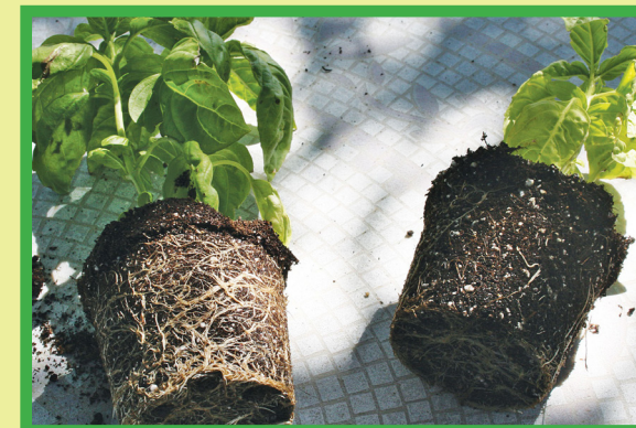
Left: just 2 tbsp Right: none applied trial period 1 month

*qualities of worm castings are paraphrased from Vermiculture Technology , (2011) Edwards, Arancon, Sherman.